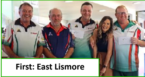
First: East Lismore