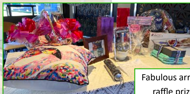
Fabulous array of raffle prizes