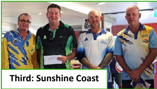
Third: Sunshine Coast