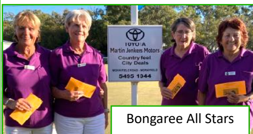
Bongaree All Stars